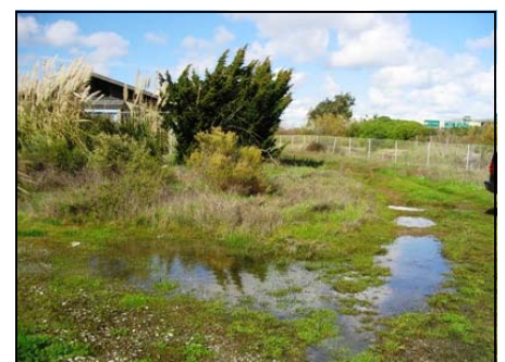
Impounded water at Mills Field.

Sewage treatment plants are being treated every 3 weeks this month. Mosquitoes develop in inoperative tanks, raceways and in water trapped under buildings. Technicians treated for mosquitoes at plants in Burlingame, South San Francisco, Half Moon Bay and San Mateo.