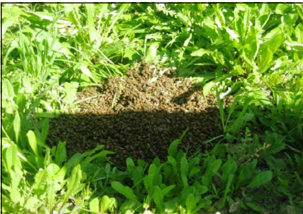
A swarm of bees found on the ground in Woodside.

Beginning in late March, residents often call the district to report huge clumps of buzzing bees seen congregating in tree branches or on the sides of buildings. These clusters of bees can range in size from a small baseball to bigger than a basketball. When established bee hives reach full capacity and become overcrowded, the queen, along with half of the colony, leave or "swarm" in search of a new home. When the queen leaves, a new queen emerges and takes over the original nest.