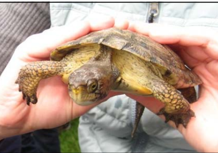
Western Pond Turtle