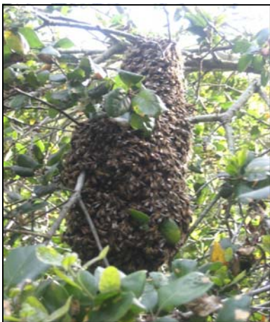
The same swarm that was seen on the ground in Woodside. A day later the swarm moved into this tree.

Worker bees in the swarm, called "scouts", seek out a suitable place to establish a new hive. When the scouts find a favorable site, such as a hollow tree, they report back to the swarm with their findings and the entire swarm moves into this new home. This process can take up to a few days. Huge swarms of bees look intimidating but are relatively harmless! They have no hive or honey to protect and therefore are not aggressive.