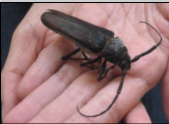
Order: Coleoptera, Family: Cerambycidae

This month, a resident brought in a longhorn wood boring beetle (Family: Cerambycidae) for identification. She was startled by its large intimidating size and assumed it was an exotic species from a tropical forest. These beetles are common in North America and are one of the largest beetles found in California! Adult beetles lay their eggs in recently killed or freshly cut pine or fir logs. The larvae then bore into the wood where they develop into pupae. The adults range in size from 40 to 65 cm. They are not considered a structural pests and will not bore into treated wood.