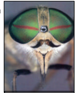
Colorful eyes and biting mouth parts of a Tabanid fly.

Two types of traps, a box trap and a malaise trap, were set out in the field to assess fly populations. Ground squirrels were trapped and blood samples were obtained to test for tularemia.